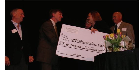
Business Plan Competition Awards Ceremony

Awards in the fields of Bioscience and Nonprofit have been created to encourage the development and growth in these important business sectors. Special cash awards are given for the top business plans in these categories.