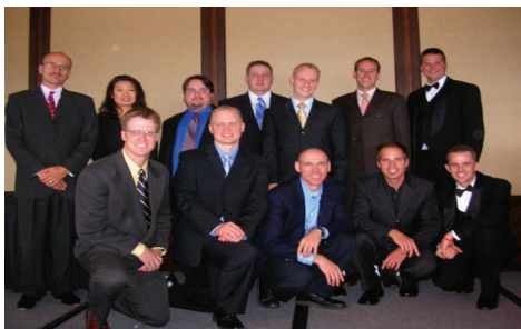
2007 Business Plan Competition Winners